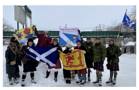
THE GREAT CANADIAN KILT SKATE 2023 FEBRUARY 26, 1-3 PM - Location TBA