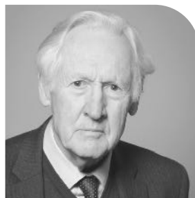
The Rt. Hon. James Alexander Douglas- Hamilton, P.C., Q.C., Lord Selkirk of Douglas